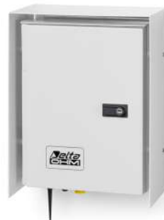
Example of installation in the housings for weather stations.