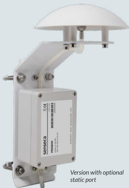
Version with optional static port