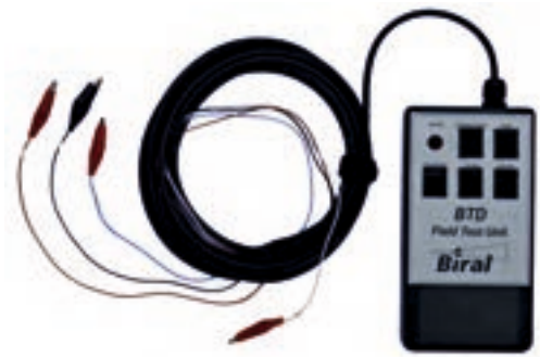
BTD-300 Field Test Unit

The BTD-350 Field Test Unit is a simple battery powered device which simulates lightning in several range bands. It can be used as part of commissioning tests or during routine maintenance activities to enhance user confidence.