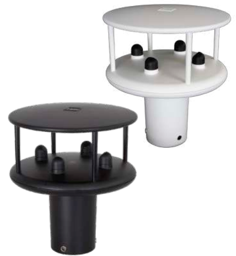
WindSonic ultrasonic anemometers offer high accuracy, low cost wind measurement